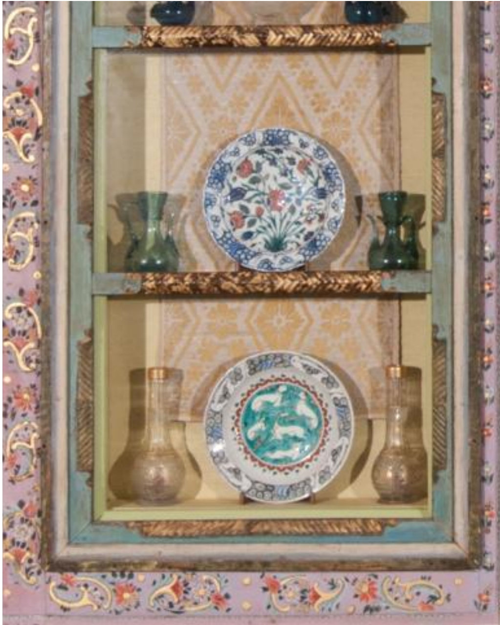
Polychrome Wooden Panels with Arabic Poetry Inscriptions