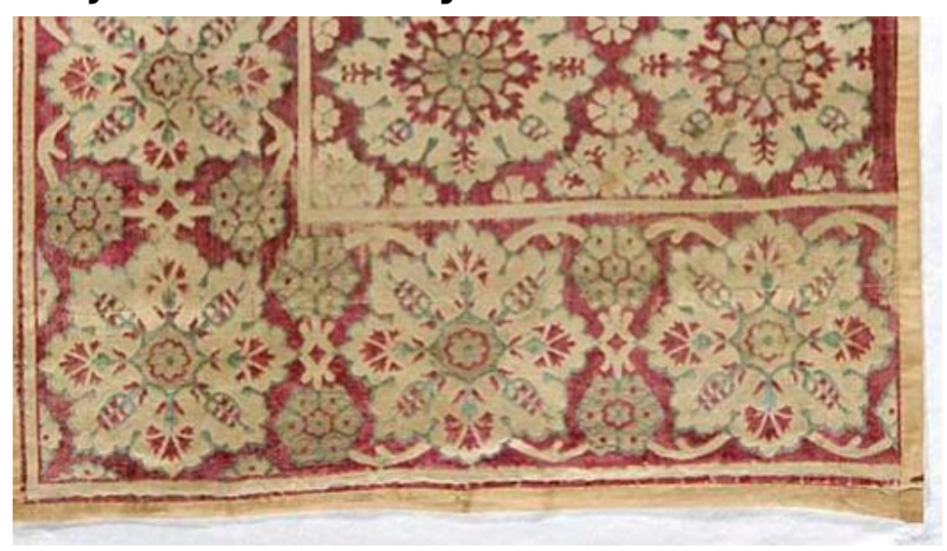
Voided Silk Brocade Çatma Panel with Floral Motifs