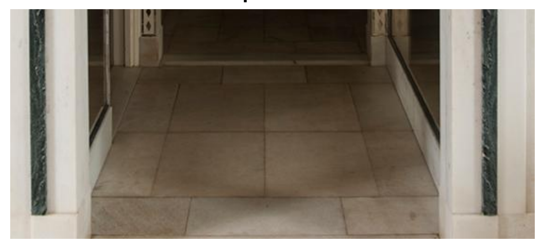
Title Carved Marble Archway with Floral Motifs