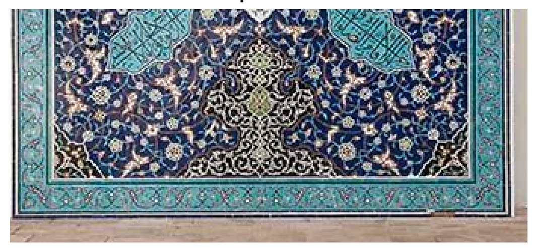
Title Polychrome Cut-Mosaic Tile Panel (Copy of Masjid-i Shah Panel)