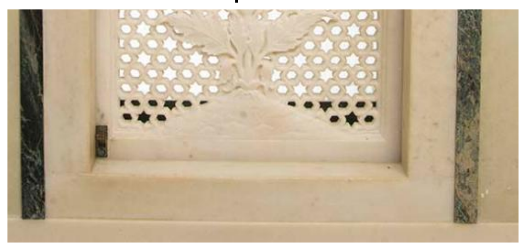
Title Carved Marble Jali (Screen) Window with Floral Motifs