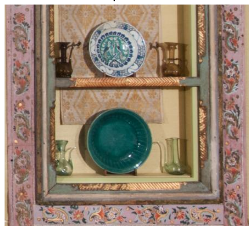
Title Polychrome Wooden Panels with Arabic Poetry Inscriptions