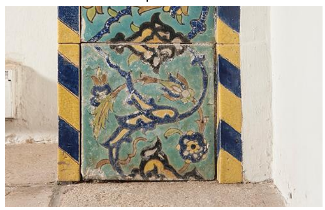
Title Polychrome Border Tiles with Flowering Vine Motif