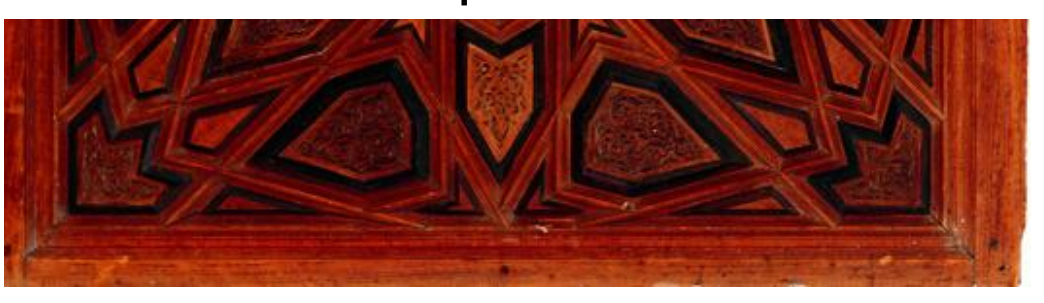
Title Carved Wooden Panel with Central 12-Pointed Star Medallion